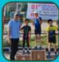
Gunmay Grade IV-Prithvi